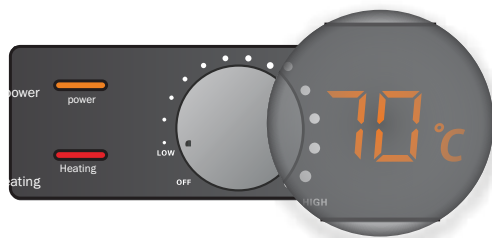
Digital Temperature display.